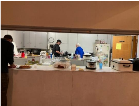
Prepping before Company Comes!

January Newsletter Items will be due, Tuesday, January 7 th , to include pictures from our New Year's Eve Party, Thank you for your patience!