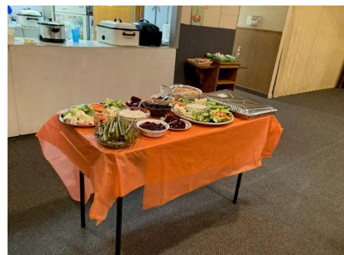
Salad Table, Yes Only Salads!